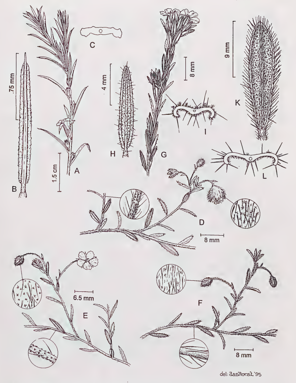
Fig. 1. A-C, Hibbertia cistiflora subsp. rostrata. A, flowering branch; B, cauline leaf from below; C, transverse section at middle of cauline leaf (R.D. Hoogland 11896). D, H. humifusa subsp. humifusa, flowering branch (H.R. Toelken 8362). E, - subsp. erigens, flowering branch (R. Thomas 583). F, - subsp. debilis, flowering branch (A.C. Beauglehole 38020). G-I, H. incana. G, flowering branch; H, cauline leaf from below; I, transverse section at middle of cauline leaf (Ackland 12). K,L, H. sericea var. sericea. K, cauline leaf from below; L, transverse section at middle of cauline leaf (Cowle MEL 35676).